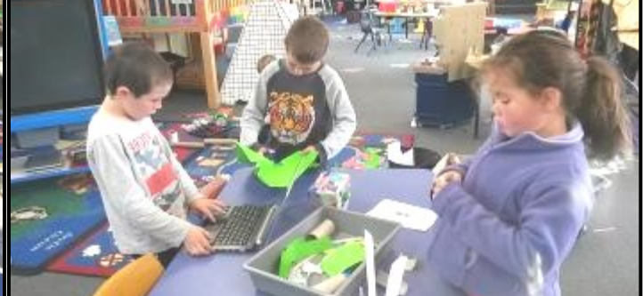
Room 2 Fun Friday challenge. To create and vehicle that was not only creative but could also move. The moving aspect of this task proved challenging with only one group managing to have wheels that rotated freely. Despite this there were many creative pieces and a lot of key competencies being used and developed.