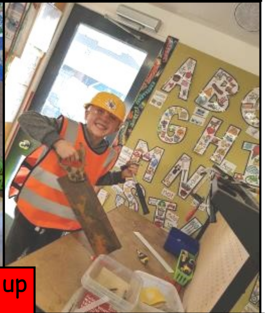
The Construction Table is up and running in Room 1