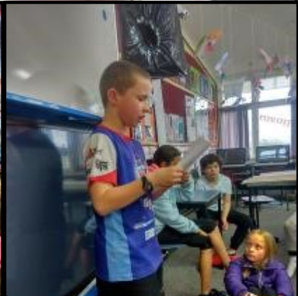
Room 4 presented their home learning.